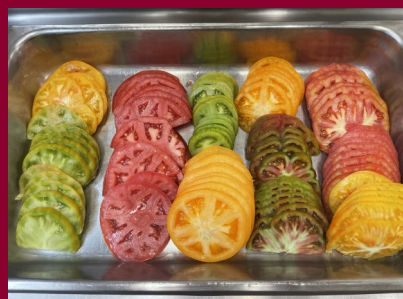
Bartlett's Farm Fresh Heirloom Tomatoes

We encourage you to have your student try our delicious home cooked lunches.