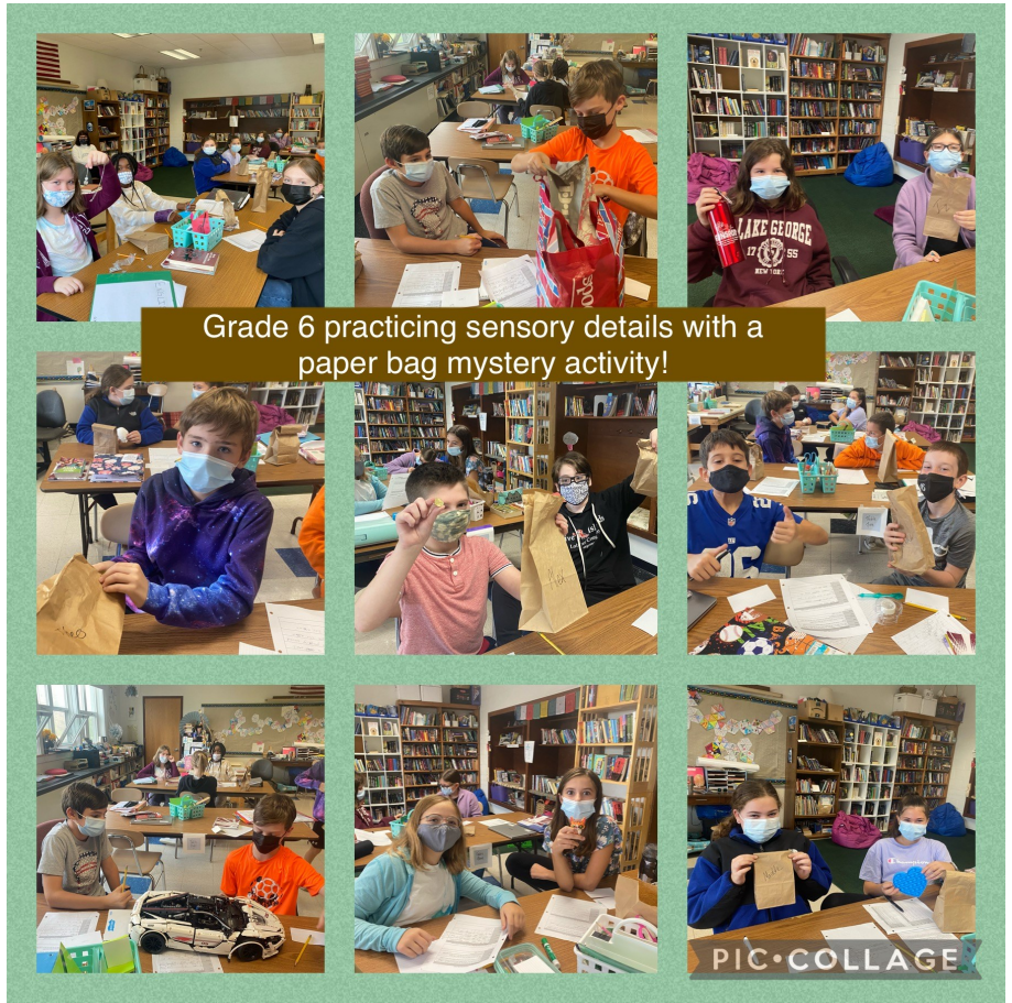
Grade 6 practicing sensory details with a paper bag mystery activity!