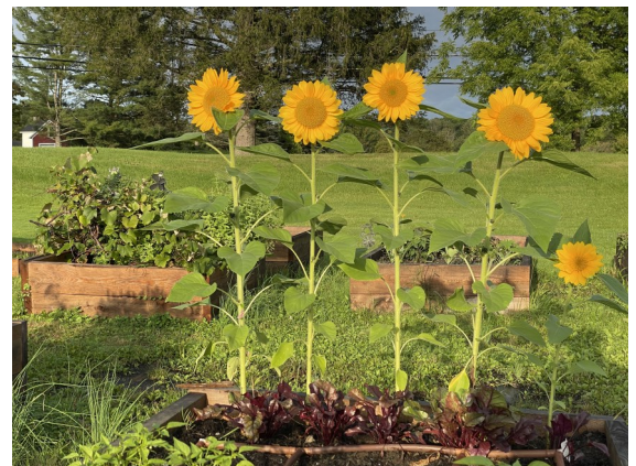
Peas on Earth Garden Flowers