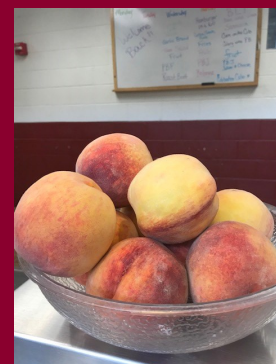
Farm Fresh Peaches

The Richmond Land Trust has regretfully cancelled the Richmond Pie Social because of the growth of the Delta Variant. We hope to see you next year.