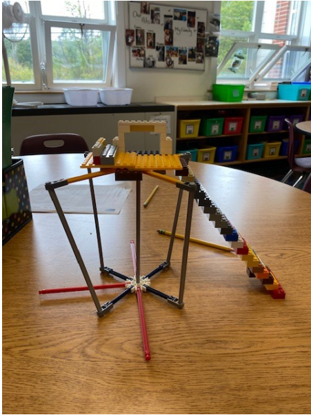
Grade 5's second "Makerspace" activity which was to create a window washer for the 4th floor using only K'Nex and/or Lego's.